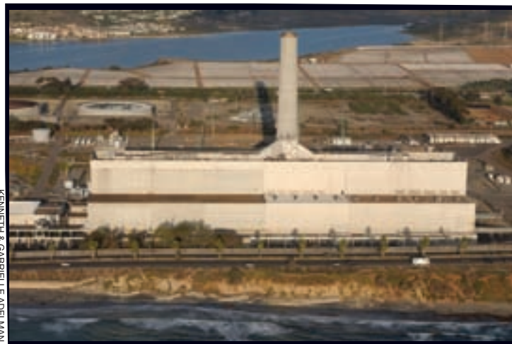
KENNETH & GABRIELLE ADELMAN

The Carlsbad Desalination Project consists of a 50 million gallon per day seawater desalination plant and associated water delivery pipelines. The project is located at the Encina Power Station in the City of Carlsbad.